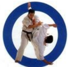
回転し蹴り Roll Kick