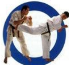
後ろ蹴り Back Kick