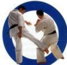
下段蹴り Low Kick