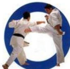
中段蹴り Middle Roundhouse Kick