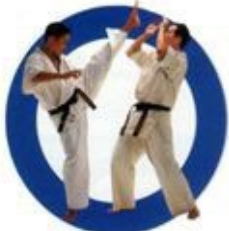
踵落とし蹴り Axe Kick