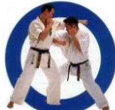
肘打ち Elbow Strike