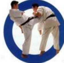
膝蹴り Knee Kick