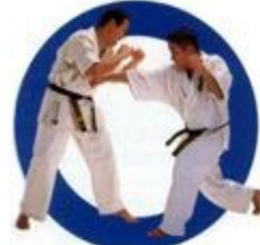
正拳突き Fore-Fist Thrust