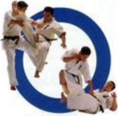
足掛けから同時に下段突き Leg Sweep Followed By A Strike