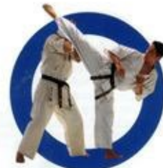
後ろ廻し蹴り Spinning Back Kick