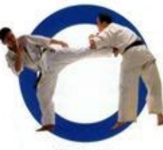
横蹴り Side Kick