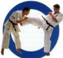
前蹴り Front Kick