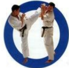
上段蹴り High Roundhouse Kick