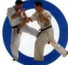
下段蹴り Low Kick