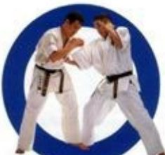
下突き Lower Thrust